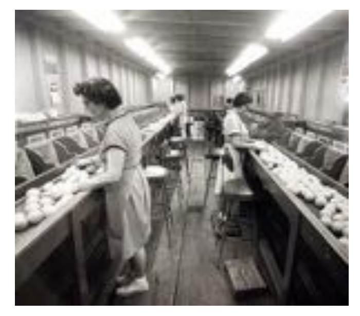
mage Source: EastValleyTribune.com

Farmers form the Arizona Citrus Growers Association, which makes it easier and cheaper to package and ship their produce.