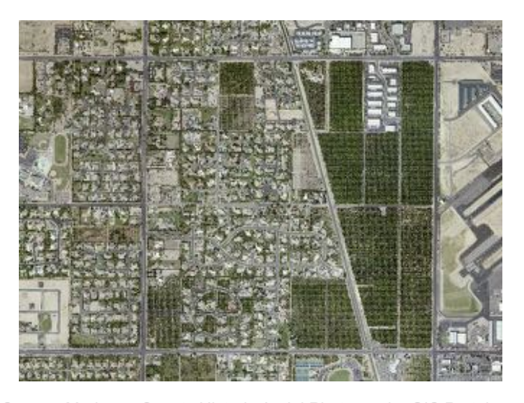
Image Source: Maricopa County Historic Aerial Photography GIS Portal, 2016 September – December (Val Vista to Greenfield / McDowell to McKellips)

Arizona citrus production has been steadily decreasing since the 1970s as the population grows and <u>agricultural</u> land is turned into housing developments and strip malls.