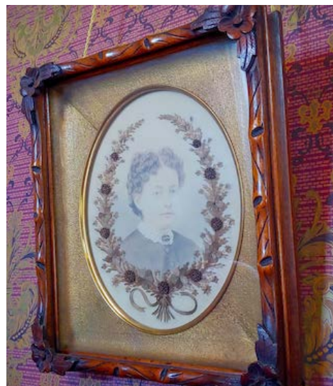
Memorial portrait and hair wreath, c1870, Heritage Square collection.