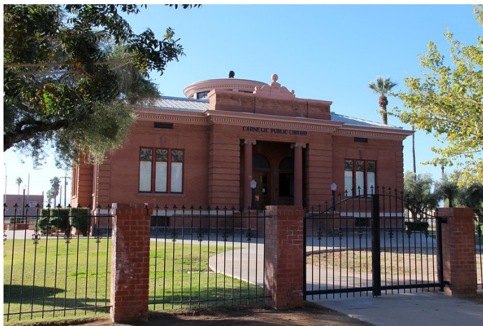
The Phoenix Carnegie Library, est. 1908.

The library moved into City Hall in 1899 and later its own building with grant money Phoenix received from Andrew Carnegie – a Victorian Era multi-millionaire steel magnate who used his money to improve his reputation and legacy by helping build over 1,700 libraries nationwide. The Phoenix Carnegie Library (now known as the Carnegie Center) opened in 1908 with 7,000 books. It was the only public library in the City of Phoenix until 1914, and served as the main branch of the Phoenix Public Library until 1952.