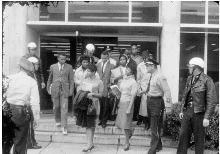
Members of the Tougaloo Nine after their arrest outside the Jackson, Mississippi Public Library, 1961.

When the Comstock Act was passed in 1873, it suppressed "the trade in, and circulation of, obscene literature and articles of immoral use." This vague and non-specific language meant that virtually any book banned, including Chaucer's The Canterbury Tales and books by John Steinbeck, Ernest Hemmingway, D.H. Lawrence, and more. Though some books today are objected to because of language/profanity, nudity/sex, and violence, the vast majority of books that are unjustifiably targeted by books bans feature at least one of these topics: LGBTQ+ characters and/or identities, characters of color and/or race/racism in American history, or sex education. You can find these great books on Barnes & Noble's Banned and Challenged Books List and can learn more about book bans and how to fight against them from the American Library Association website .