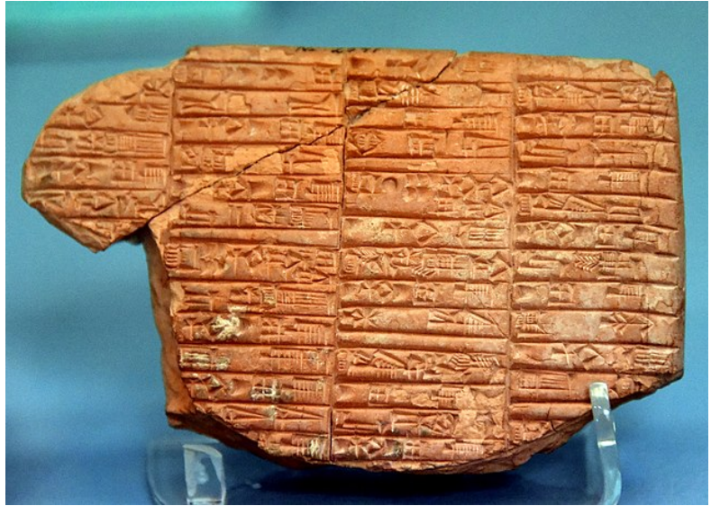
Clay tablet mentioning a list of goats, sheep, and lambs, dating to the 23 rd century BCE, Nippur, Iraq (Ancient Orient Museum, Istanbul).

There is just something about being in a library surrounded by books – the smell, the sound of the pages turning, the seemingly infinite amount of knowledge and number of stories just waiting to be explored. But the first libraries and archives predated books, as people used clay tablets to record their histories and information. Clay tablets dating as far back as 1000 BCE and 3000 BCE have been discovered in ancient records rooms in the Babylonian town of Nippur (now Iraq), and at Tell el-Amarna in Egypt.