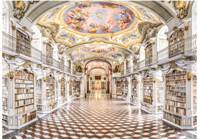
The Admont Abbey Library, Austria, founded in 1072 CE by Benedictine monks

Libraries as we know them were at first privately owned, by individuals or organizations (generally governments or churches) who were wealthy enough to be able to both afford books and to know how to read them. During the American colonial period, books had to be shipped from Europe, which led to their high cost. The first “public” libraries were available only to people who purchased memberships or subscriptions. Benjamin Franklin helped start the first of these in the American colonies, called the Library Company – each member had to invest 40 shillings to start, and 10 shillings each year to maintain their subscription. His library still exists today as a research library with its original books and many more. (Fast Fact: Benjamin Franklin also created the first mail-order catalogue in the colonies in 1744, and it’s no surprise that was for buying books! The catalogue was essentially a list of books available for purchase – almost 600 of them in fact, including books on history, divinity, law, mathematics, philosophy, physics, and poetry. Read more about the history of catalogues from our December 2021 blog article, Mail-Order Catalogues. )